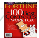
Griffin Hospital, Connecticut

*More than 175 hospital affiliates in 33 U.S. states, Brazil, Canada, Japan, and the Netherlands